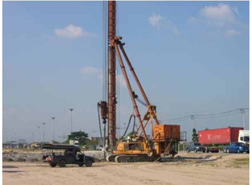
DCM work in progress to improve foundation soil of a highway.