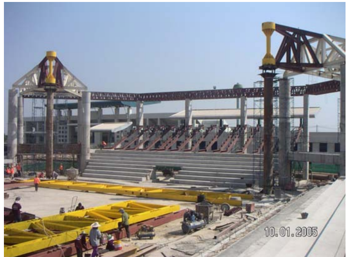
Installation steel frames and trusses in progress.