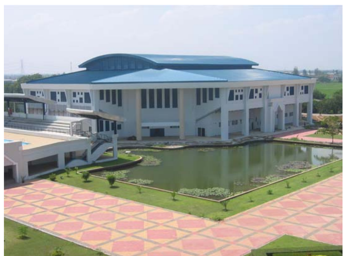
A photo of the stadium.